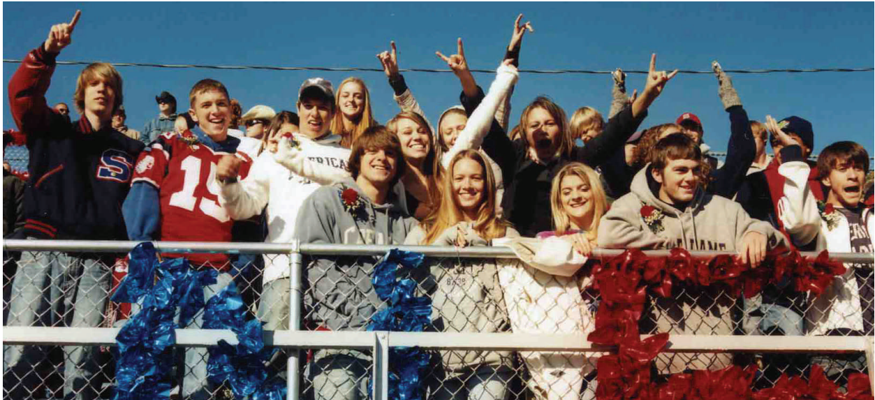
High school seniors cheer at the Homecoming Pep Rally marking the opening of the newly renovated Lockhart Street Bowl. Students from Litchfield and Snyder Elementary schools also attended the event.