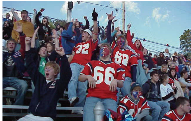
High school students, including several members of the football team, help make "waves" at the Homecoming Pep Rally.