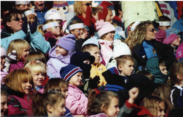
Elementary students dressed for the crisp October weather on the occasion of the Homecoming Pep Rally held at Sayre High School.