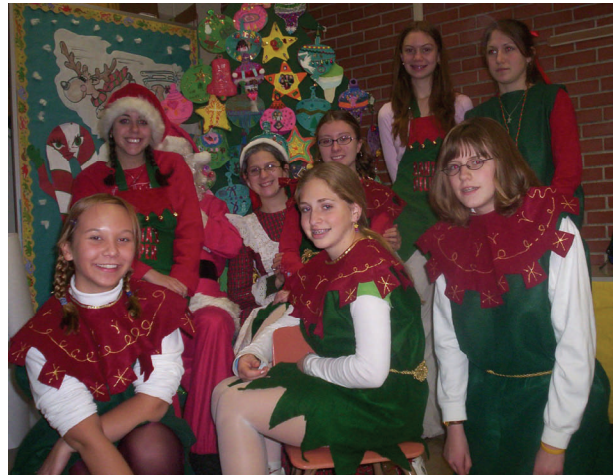
Student council members help "Santa" as part of a picture taking event at Snyder and Litchfield elementary schools.

In February, student council planned a Human Foosball Tournament for a fundraiser. Human Foosball consists of a team of 5 players. The game is played inside an inflatable ring with a sponge ball. Players wear a vest that has a big ring on the back through which slides a pole to keep you from moving forward and backward (you can move side to side). This event was held Wednesday, February 16th in the Sayre High School gymnasium.