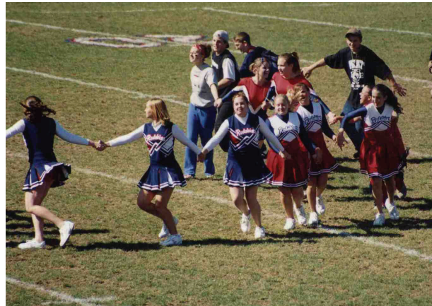
Sayre cheerleaders show the way as students re-enact an old tradition of the "Snake Dance" at the Homecoming pep rally.