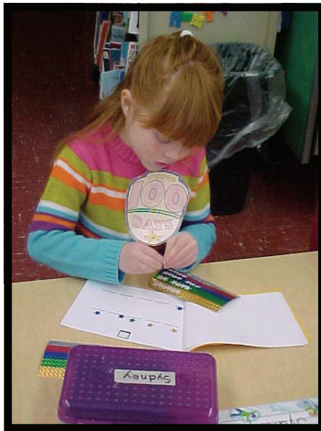
Making a 100 star sticker