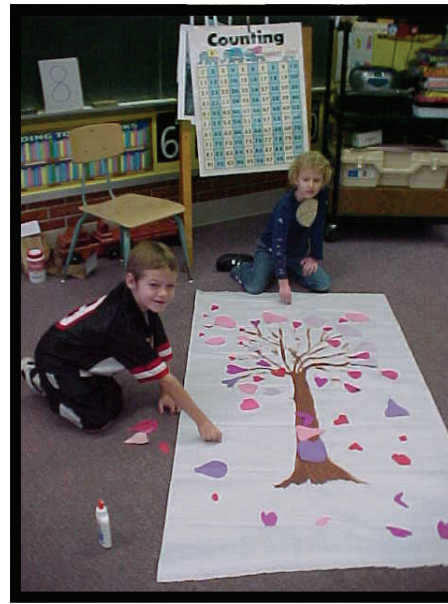
Making a 100 heart tree

On February 9, 2004 the class celebrated the 100th day of school. Along with the above activities, the children made their own hats and badges to wear. They counted by 1's, 5's and 10's. They experienced 100 seconds by sitting quietly. They exercised by doing 100 jumping jacks. Paper chains were made with 100 links. A school party was held with the other classes to celebrate the day. A 100 item guessing game with riddle clues was played with objects the children found at home. A 100 piece puzzle was started. And, the book One Hundred Hungry Ants was read. The children had a wonderful day by learning through a variety of ways.