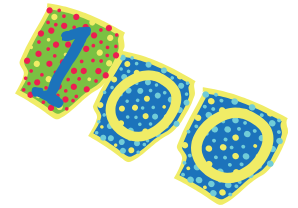
Making a 100 piece snack mix