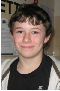
Tyler Gerner Meghan Fox