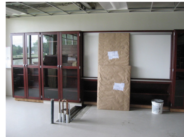
New cabinets are being installed as part of the science room renovations.

"I'm looking forward to be working with hot and cold water with a solid draining system at every lab table," she said. "How could you not be excited?"