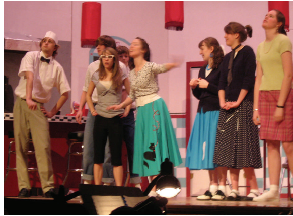
Cast members prepare for opening night at an assembly for students.