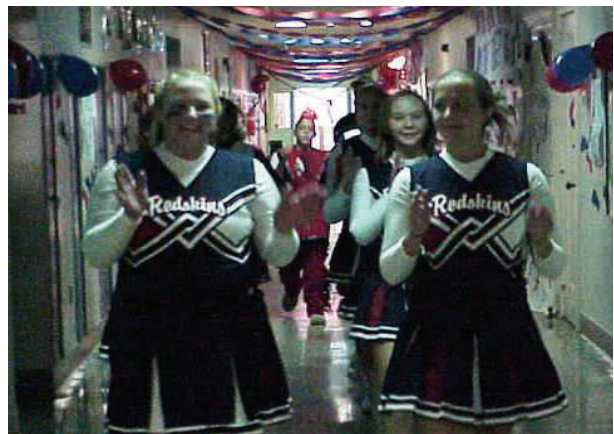
Sayre Cheerleaders march down the hallway.