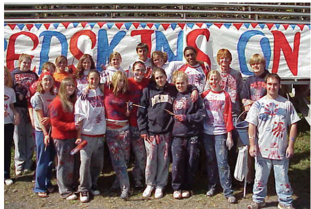
Seniors pause for a picture after field painting for Homecoming.